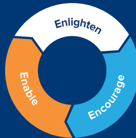
The Three Necessary Conditions for Initiating and Sustaining Successful Behavioural Change

The ultimate objective of most 360-degree feedback programmes is to successfully change behaviour leading to increased effectiveness. Achieving this objective requires three conditions: enlightenment, encouragement and enablement. A 360-degree feedback assessment provides insight and enlightenment. But, without the other two, you won't demonstrate sustained and successful behaviour change.